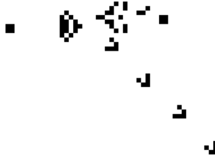
Figure 13.2: ... in action.