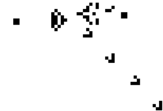
Figure 9.9: . . . in action.